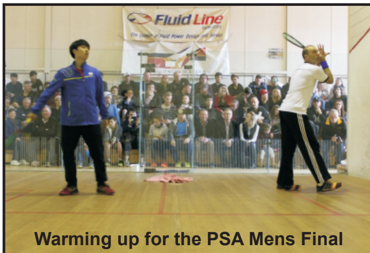
Warming up for the PSA Mens Final

All Golden Open Photos including the cover shot courtesy of David Cowell and Rita Baldwin.