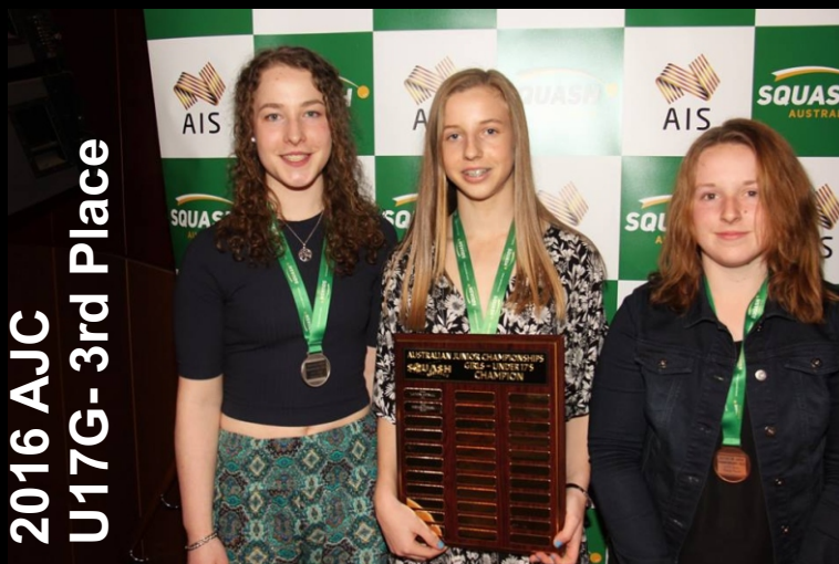
2016 AJC U17G- 3rd Place