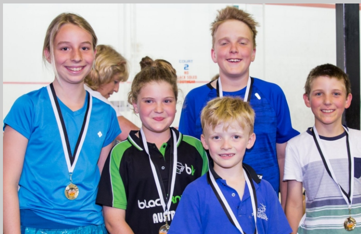
Encouragement Award Winners