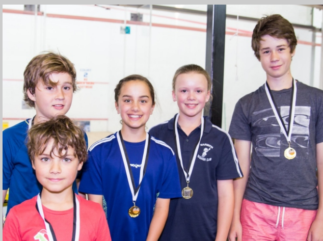
Coaches Award Winners