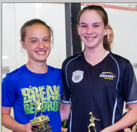
Girls U13 and U15