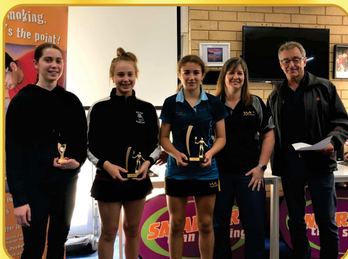
Under 17 Presentations