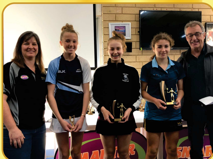
Under 15 Presentations