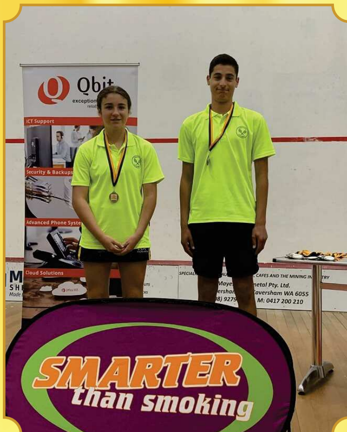
Under 17 Team Champs