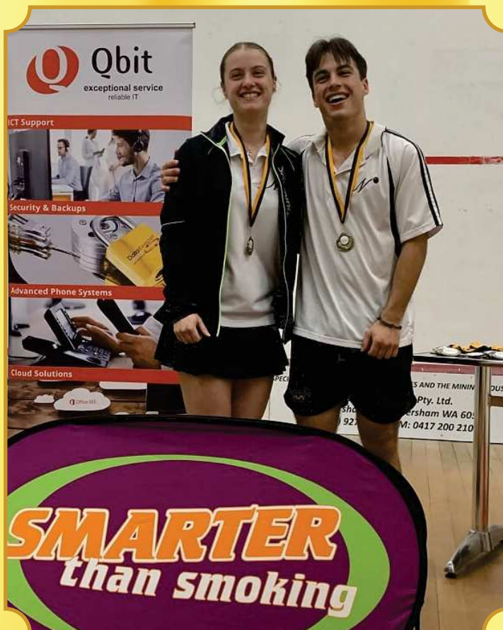
Under 19 Team Champs