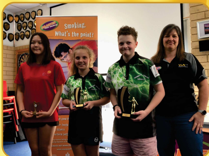
Under 13 Presentations