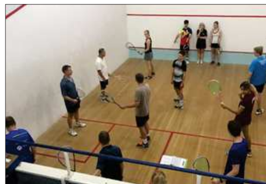
Participants using their non dominant hand

Thank you to Belmont Squash for allowing me to run this course at their centre. Thank you to the ladies who were coached. They advised they had fun and learnt a lot.